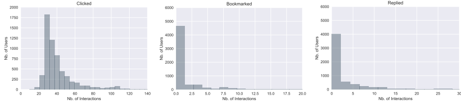
Fig. 1: The number of users with respect to the number of interactions. From left to right, for Clicked , Bookmarked and Replied tasks.